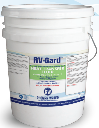
Available in a variety of sizes.